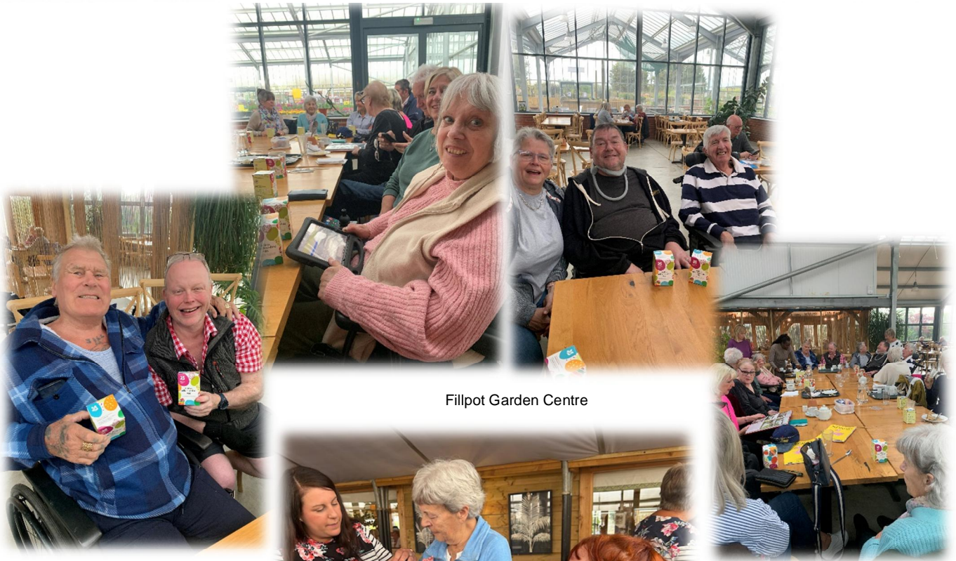
Fillpot Garden Centre