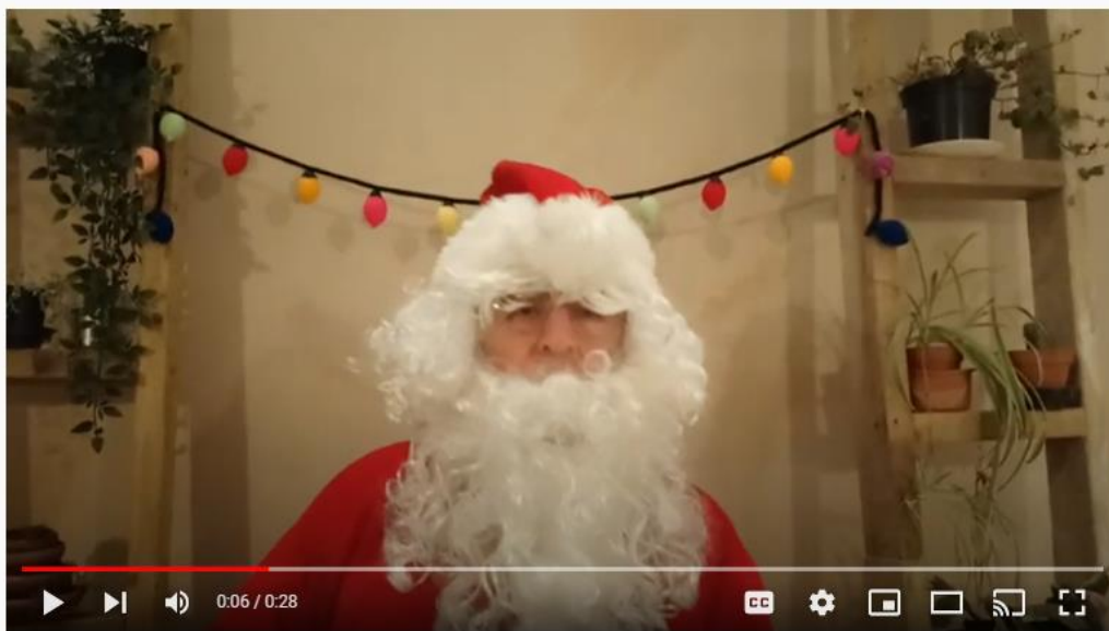
Santa's Message to West London MNDa

Despite our Seasonal Party being cancelled, we were able to pass on some Christmas cheer. Santa very kindly recorded a message especially for us which he put on You Tube. Our musical friends, The Old Standards, who have performed at many past parties, helped out too. They let us have a recording of 'Santa Claus is Coming to Town' which we emailed to everyone. Thanks to them all.