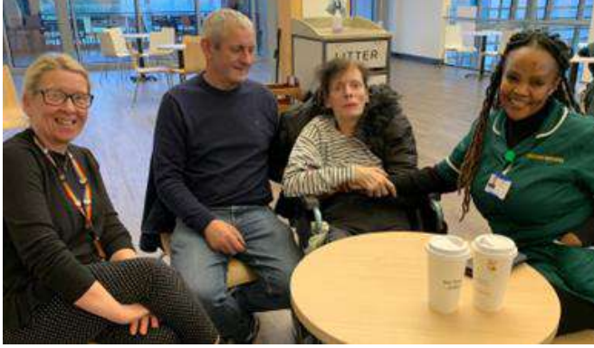
Trying a new venue at Skelton Lakes Services. M1 J45, Leeds, approximately 2 miles east of Leeds city centre.